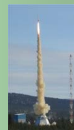
Launch of Maser11

Call for Abstracts: Workshop website http://hti.ulb.ac.be/ provides the latest information. Submit your abstracts, template and instructions are available on the website, and a registration form to the Workshop Secretary via e-mail hti@ulb.ac.be , by 1 of February, 2011 . Notification of a presentation acceptance: no later than 1 of June, 2011.