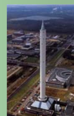
Drop tower